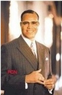
Hon. Min. Louis Farrakhan