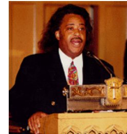
Rev. Al Sharpton